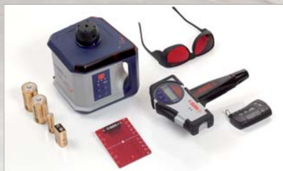
Agatec RL110 scope of delivery